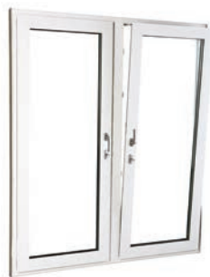
Tilt and turn door