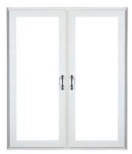
Terrace door with central mullion (option of hinges on the exterior walls or mullions)