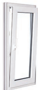
Single or combined tilt and turn window

Strassburger Tilt and Turn windows and doors are designed for maximum brightness and unimpeded views with a unified and consistent look that makes them ideal to pair with existing windows and doors.