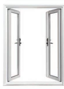
Fully opening French door (hinges on the sides and astragal)